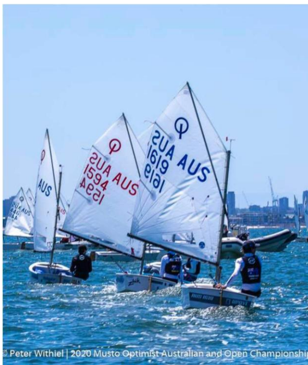
2020 Musto Optimist Australian and Open Championship